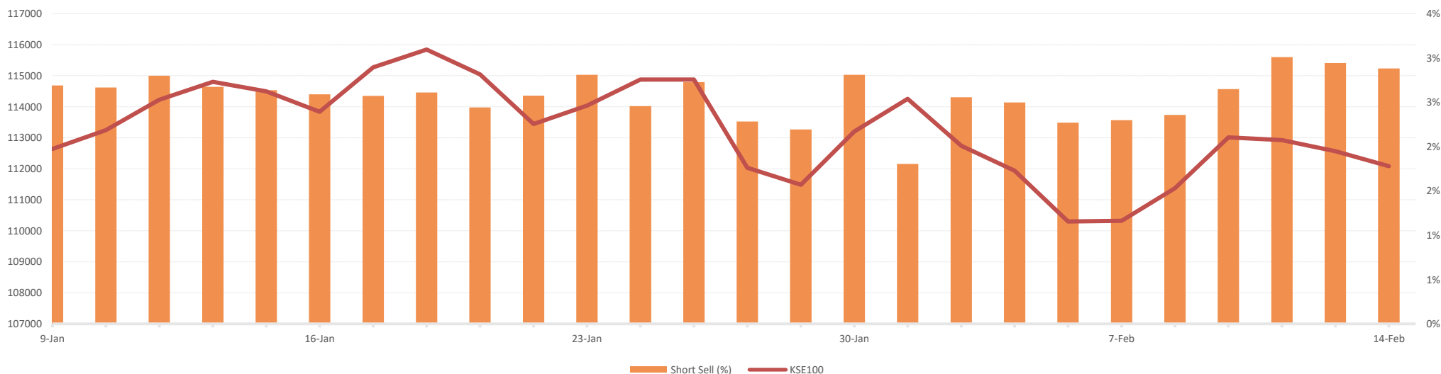
KSE-100 VS % Short Sell Of Total Open Interest